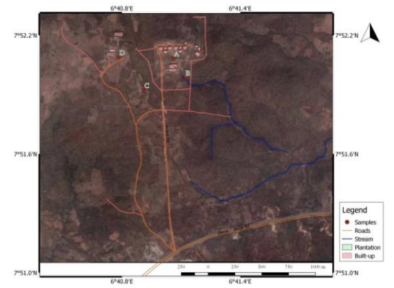
Fig 1: Google Earth Map of Federal University Lokoja, Felele Campus showing the sampling sites.

The study area was divided into four (4) sampling plots with the aid of a quadrat, each measuring 30m by 30m. Plot A : was behind the Vice Chancellor's office building (Latitude 7<sup>0</sup> 52' 4.464" N; 6<sup>0</sup> 41' 3.672" E) which was predominately occupied by grasses like Hyptis suaveolens , Ageratum conyzoids and Tridax procumbens . Plot B : was a swampy area directly in front of the Vice Chancellor's office building (Latitude 7<sup>0</sup> 51' 59.193" N; 6<sup>0</sup> 41' 7.234" E) which had a small stream. Plot C : was the woody plants' area along the main road leading into the University (7<sup>0</sup> 51' 56.421" N; 6<sup>0</sup> 40' 55.039" E) not too far from the Vice Chancellor's office building. Plot D : was the open space in front of the female hostel (7<sup>0</sup> 52' 6.028" N; 6<sup>0</sup> 40' 47.570" E) with marked farming activities.